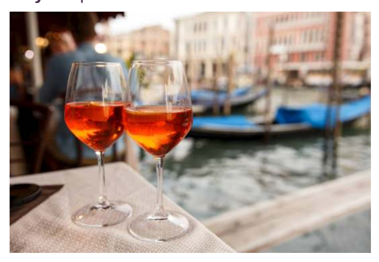
Day 10 | Farewell Venice

For now, it's time to say a fond arrivederci to Italy and newfound friends who have shared in the memorable sights, sounds and flavours.